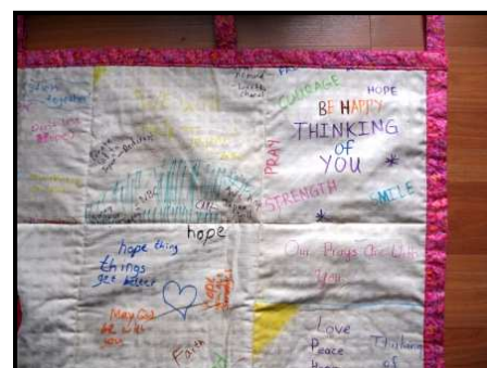
One of the quilts made by students to show their support for the people of Japan.

seventh grade students to keep the Japanese victims in their prayers.